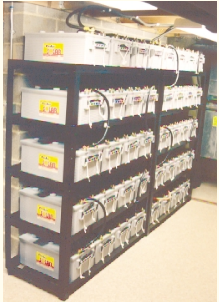
Sealed solar gel batteries located in an open basement rack

Pressure treated 2 x 4s on edge, spaced every 6 inches and covered by a fiberglass laminated concrete board, makes an excellent base for your battery box. This heavy sheet material is sold in most building supply outlets as a backing behind ceramic tile work in wet shower stalls, and