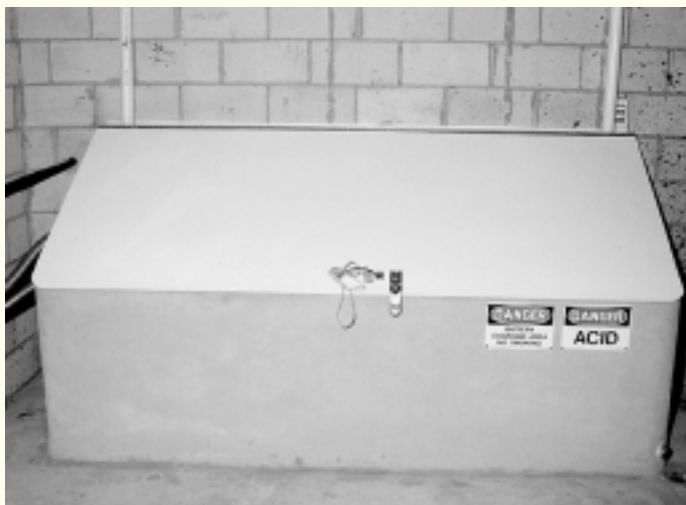
A well designed vented battery box. Note the warning signs and locked lid.

golf cart batteries, while others use sealed or gel cell batteries, and each have different temperature, mounting, and ventilation requirements.