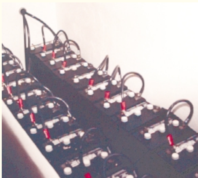
Interior view of the battery box showing the battery inter-connects and fuses.

A typical 6-volt golf cart battery will store about 1 kilowatt-hour of useful energy (6 volt X 220 amp-hr X 80% discharge = 1056 watt-hours). Since this would only power two 50-watt incandescent lamps for 10 hours (2 X 50 X 10 = 1000 watt-hours), your alternative energy system will most likely require wiring several batteries together to create a battery bank. Since each golf cart battery weighs