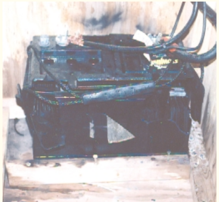
Visible are the exploded plastic case exposing some of the internal plates as well as battery acid damage to the nearby wood walls and flooring.

One of the most misunderstood parts of a solar power system is the battery or battery bank, and that is where our class begins. Some solar battery banks use wet cells, like